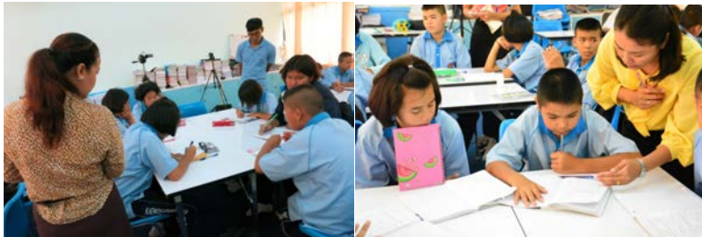
Figure 3. Classroom observation of Lesson 2 Class A and B

“Teacher B discuss and compare students’ ideas.” (Rater 3’s field notes)