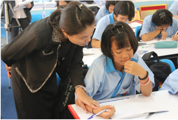
Figure 5. Classroom observation in Lesson 10

In addition, Teacher A and Teacher B's verbatim interview data during the reflection step of LS after Lesson 10 revealed that: